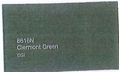
Clermont Green #8616N